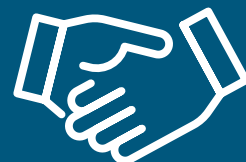
SECONDMENTS AND ATTACHMENTS

During the second year of the programme, participants have the opportunity to spend up to four weeks on an external secondment or internal attachment within their force. External secondments are an excellent way for participants to experience professional life beyond the service, as well as build knowledge about policing in the wider society.